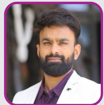
Dr. Esaki Raja Hall Inauguration